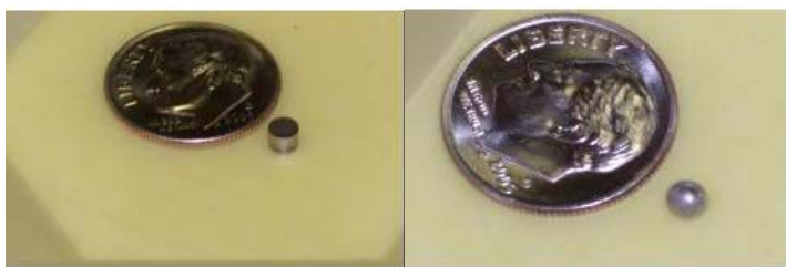
Tc/Zr sample before and after arc melting.