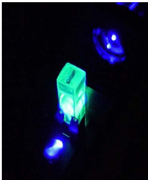
Laser induced fluorescence of a uranium sample in nitric acid

Both techniques are strongly dependent on the chemical speciation of the elements to be measured, providing a tool for not only the determination of material concentrations for mass balances, but also providing inspectors and plant operators with a tool to examine the process chemistry itself. As optical techniques, both of these methods can be adapted for fiber optics, allowing the instrumentation to be