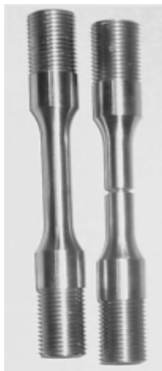
Tensile (Smooth & Notched)

The general and localized corrosion behavior of all four heats of T91-grade material will be determined by using rectangular coupons. The susceptibility to stress corrosion cracking (SCC) will be evaluated by using tensile and self-loaded C-ring and U-bend specimens in both LBE and aqueous environments. SCC testing using cylindrical specimens will be performed in aqueous environments either at constant load (CL) or under a slow-strain-rate (SSR) condition. The C-ring and U-bend specimens will be tested in an autoclave in the presence of an aqueous solution at temperatures up to 650°C. The localized corrosion (pitting and crevice) tendency will be studied in an aqueous solution by cyclic potentiodynamic polarization (CPP) technique. The CPP test will determine the corrosion potential ( E_{corr} ), critical pitting potential ( E_{pit} ), and the protection potential ( E_{prot} ), if any. Fractographic evaluations of all SCC test specimens will be performed by SEM.