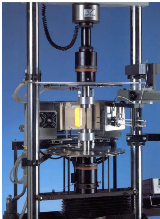
INSTRON high-temperature mechanical properties testing machine.

search Laboratory. They were subsequently processed into rectangular and square bars by forging and hot-rolling. These bars were then austenitized, oil-quenched, and tempered to achieve fine-grained and fully-tempered martensitic microstructure. Machining of different types of specimens from these heat-treated bars is ongoing.