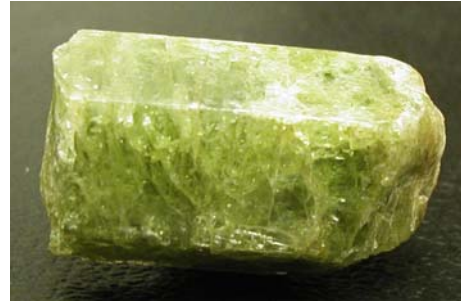
Green colored crystal (fluorapatite)

This research attempts to develop a waste form for disposing of the zirconium fluoride fission product waste stream. Fluorapatite, a naturally-occurring fluorinated calcium phosphate, has been identified as a potential matrix for the entombment of this waste stream. If the efficacy of fluorapatite-based waste-storage can be demonstrated, then new and potentially more efficient options for handling and separating high-level wastes, based on fluoride-salt extraction, will become feasible.