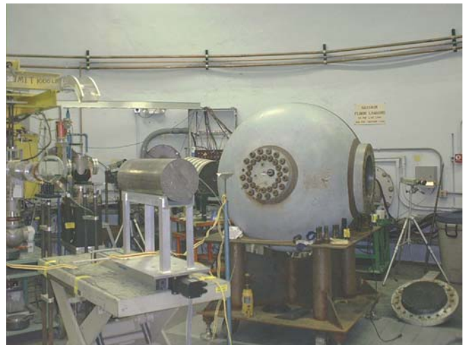
Experimental facility at LANSCE, Los Alamos, NM.