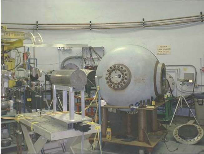
Experimental facility at LANSCE, Los Alamos, NM.

Analysis of linearization characteristics on a Beowulf cluster was completed. They are now working on characteristics of the Supercomputing Center and the linearization of criticality studies.