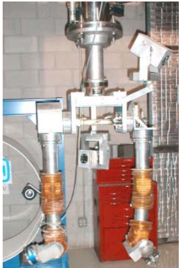
Dual slave arm end effector in the UNLV Robotic Hot Cell Unit. The master is configured identically, and is guided by a human operator.