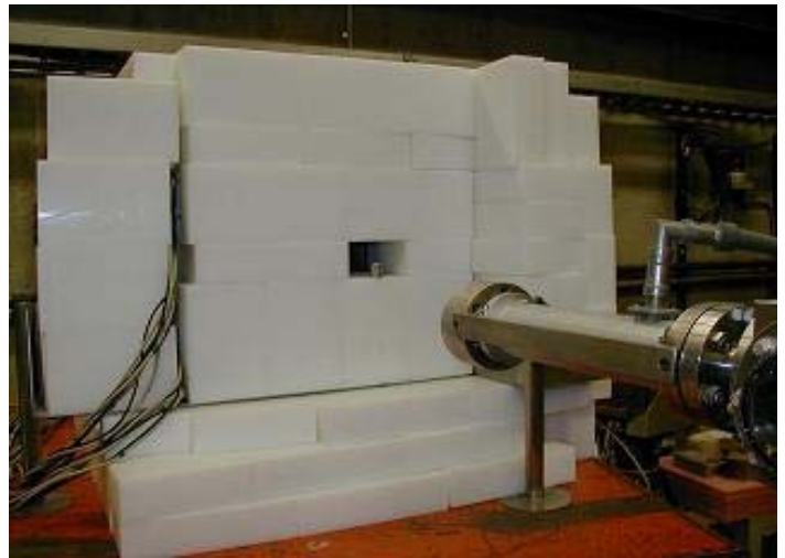
View of detector system aligned with accelerator vacuum tube and window. The beam height had not been adjusted in this photograph. The AmBe source can be seen in the opening in the polyethylene bricks of the NMDS.

The NMDS is constructed from lead bricks that may be arranged in a 30\ \text{x}\ 30\ \text{x}\ 30\ \text{cm} cubic configuration for cosmic ray measurements or as an elongated accelerator target, either 15\ \text{x}\ 15\ \text{x}\ 120\ \text{cm} or 20\ \text{x}\ 20\ \text{x}\ 60\ \text{cm} (smaller arrangements are also possible). This system may be used to measure neutron production in a variety of configurations, on a variety of targets, with a variety of source particles, and over a range of energies (10 to 800 MeV) to produce a large data base that may be used to validate neutron multiplicity predictions.