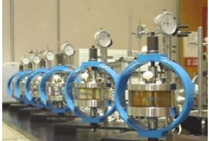
Constant load test setup.

The notched specimens were used to increase the severity of cracking. The cracking susceptibility under a constant loading condition can be characterized either by the time-to-failure (TTF) or a threshold stress for SCC, below which no cracking occurs. For SSR testing, the cracking behavior was evaluated in terms of the ductility parameters such as percent elongation, percent reduction in area, and the true fracture stress obtained from the stress-strain diagram.