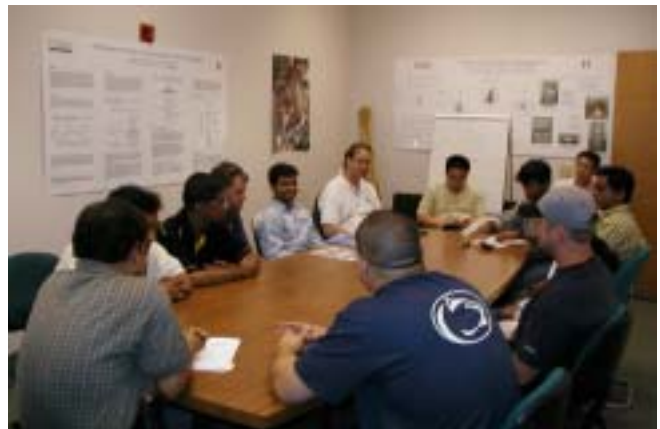
MPL weekly student and staff meeting.

Additionally, tests involving slow-strain rate units and electrochemical equipment are being performed to establish the testing techniques and related parameters. It is anticipated that all testing techniques will be standardized prior to their implementation in MPL.