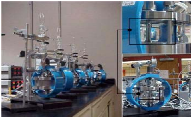
Constant-Load SCC Test Setup