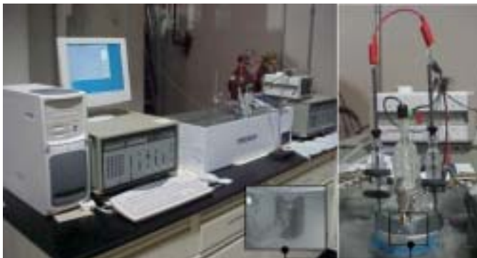
Electrochemical Polarization Test Setup